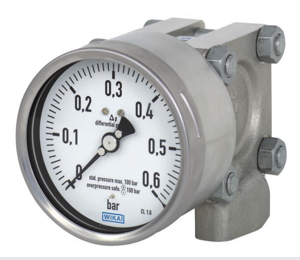
Differential pressure gauge model 732.14