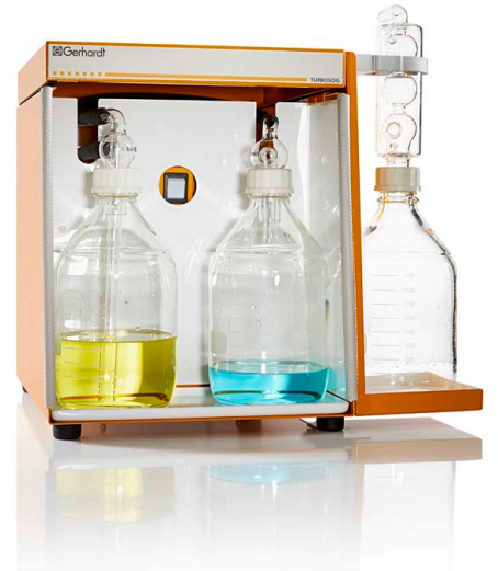
TURBOSOG with additional cooling unit ZKE

Powerful suction washer in tried and tested C- Gerhardt quality for extraction and washing out of the inorganic acid fumes created during digestion.