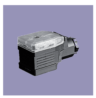
Signal conditioner MUW... (integrated in plug connector) with supply voltage 24 V and voltage or curent output signals.

Pivot head Z-60 with internal thread M6x12, P/N 058100. Process-controlled indicators MAP... with display.