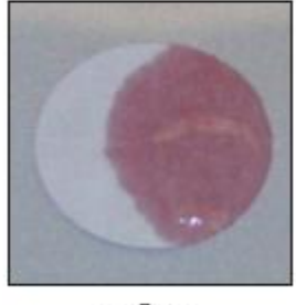
t = 5 sec.