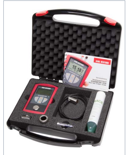
Delivery in a handy carrying case