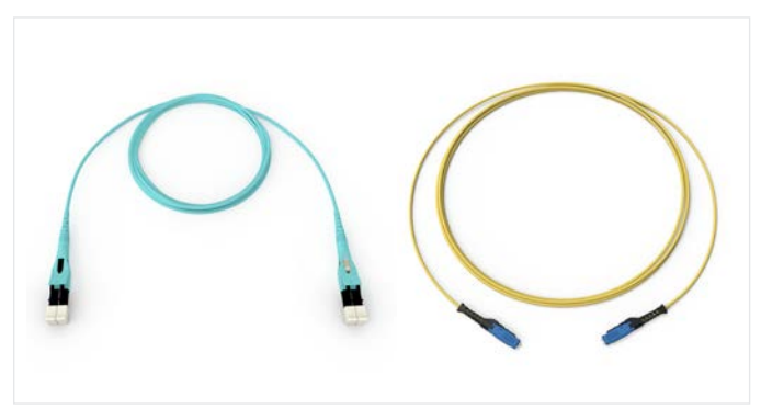
Reverse Polarity LC Uniboot and MDC Duplex Patch Cords | Photos REN6462 and REN8003

To integrate next generation high-density transceivers with an SN (Senko Nano) footprint or legacy SC connectors into existing LC duplex based infrastructures, our EDGE™ patch cords include hybrid versions as well.